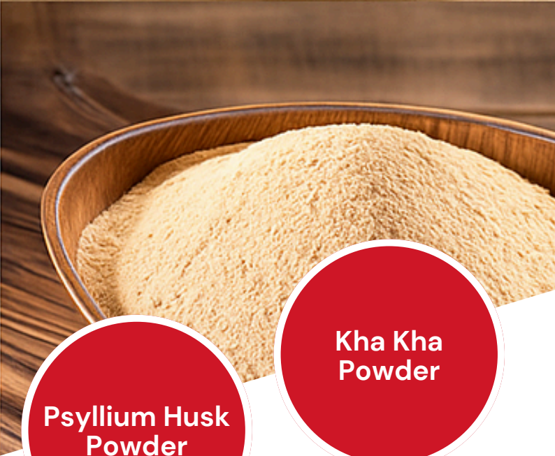
Kha Kha Powder